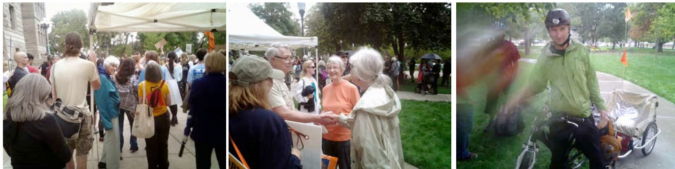
First Church Congregants at the Climate March - September 21, 2014.