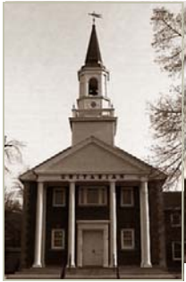
THE PRESENT CHAPEL WAS CON- STRUCTED IN 1927