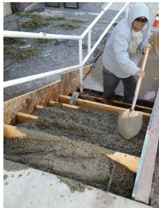
Cement replaced on north stairway