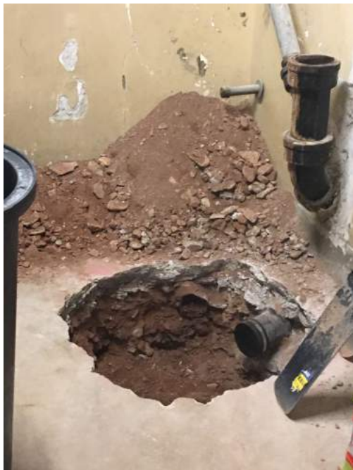
New sump pump installed in basement

We recognize that the Covid-19 pandemic has disrupted both jobs and savings accounts, but the work of the church goes on. Wood dry rot continues, equipment such as air conditioning fails, and other wear and tear on the physical plant will continue through time. Your commitment to become a Torchbearer reflects your pledge to help the church survive well into the future. We all recognize that the values of the church must carry forward to keep the church secure and well-maintained with an eye toward its future over the next 100 years.